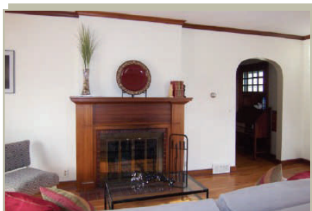
Before & After Home Staging!